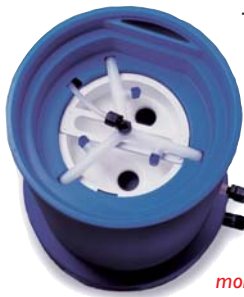
molded polyethylene spray manifold

The Pulsar 3 Chlorinator is used with a timer or any ORP-based pool automation unit. The easy to maintain Pulsar 3 Chlorinator uses a unique spray concept that enhances your pool's filtration system, helping to make your pool water sparkle. A 3/4 hp pump provides 27psi through the venturi for optimal evacuation of the chlorinator.